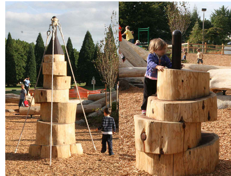
Stacked timber slices for climbing and play Images: 1 & 2 Learning Landscapes