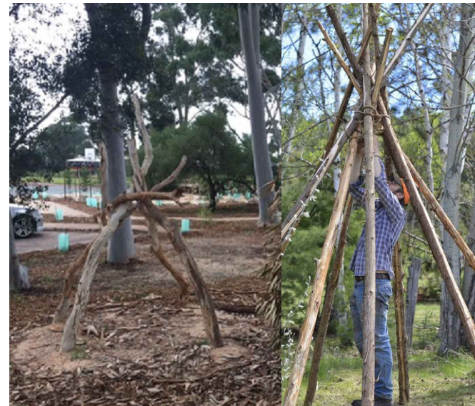
Natural timber lattees fixed together for play huts throughout upper terrace