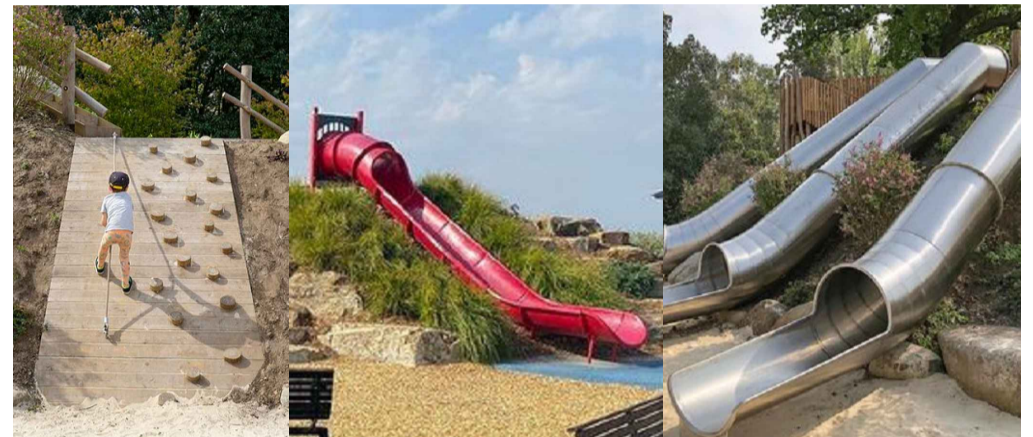
Embankment transition with climbing structure and slides