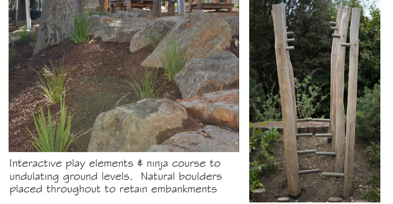
Interactive play elements & ninja course to undulating ground levels. Natural boulders placed throughout to retain embankments