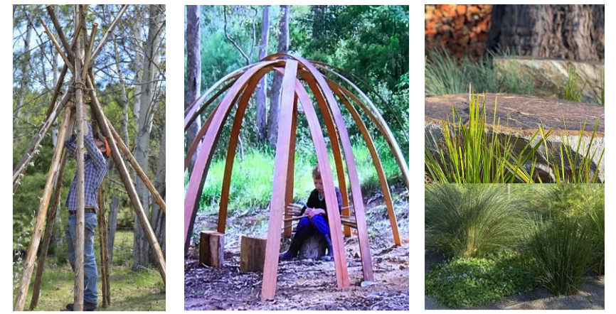
Natural timber and Corten play huts throughout upper terrace Hardy indigenous planting throughout