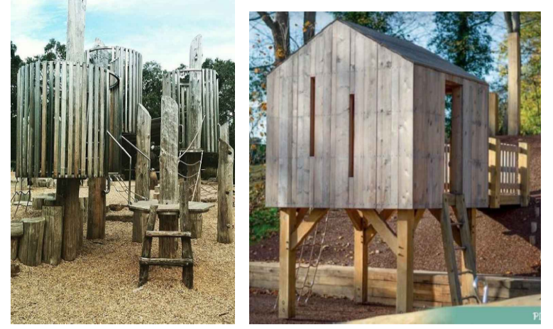
Elevated hut/s set within embankment to transition between upper and lower landings with boardwalk to additional landing/hut