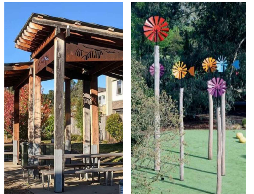
Rustic Shelter with decking for informal activities, also providing a stage for school outdoor concerts. Colourful Kinetic Flower Sculptures to Shelter