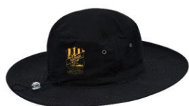
Surf Hat (widest brim) $15