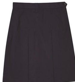
Navy Skirt $38