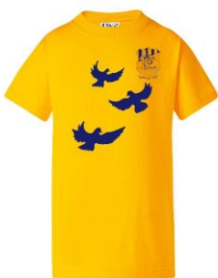
Pigeon T-shirt $20