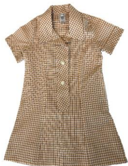
Summer Dress $60

Regular Uniform (2 sets of preferred option) NB: Long sleeves / pants also available if preferred