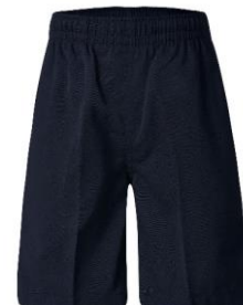
Gabardine Shorts $22