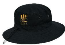
Bucket Hat $15