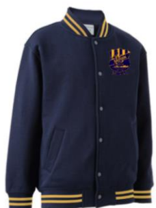
Bomber Jacket ($45)