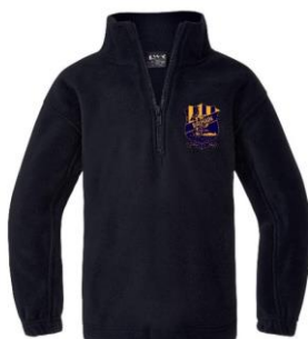
Half-zip Polar Fleece $30