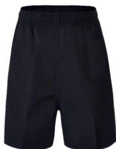
Microfibre Sports Shorts $22