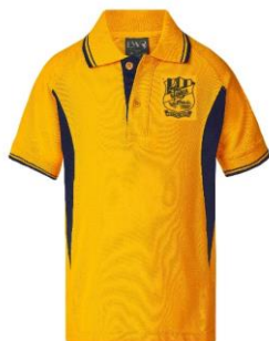
Short Sleeve Polo $26